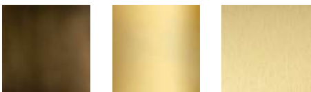
Brushed Oxidised Brass