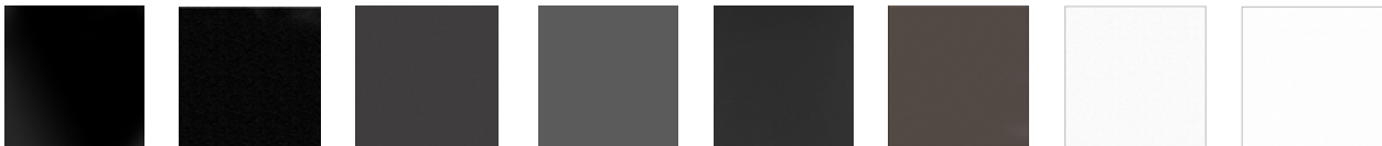
Black High Gloss